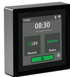
AJ-301C Central Control Terminal

AJ-315W can be installed on wall or under-desk. AJ-316D can be placed on desk. AJ-301C can be installed on wall. Depends on different conference room condition, you can flexibly deploy the system conveniently to reach the best performance.