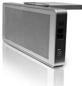
AJ-315W Audio Jammer