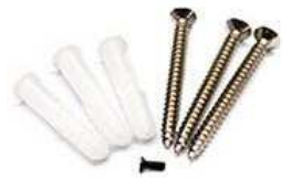
Screws & Holders